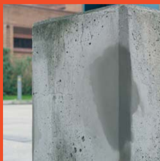
After repair with ARDEX A 46