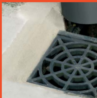
After repair with ARDEX A 46